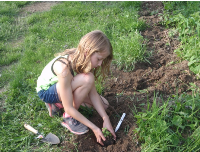
Big Flats Elementary student planting flowers at Bottcher's Landing

We installed three game cameras at boat launches where we have trouble with dumping and other issues to help law enforcement arrest people who abuse and use the boat launches for illegal activities.