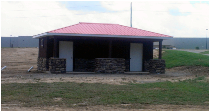
The new bathroom at the White Wagon Boat Launch

Chemung White Wagon Boat Launch improvements: River Friends obtained an $8,000 grant to help the town of Chemung build a stone, wood and steel-roofed restrooms at the White Wagon Boat Launch in the town of Chemung.